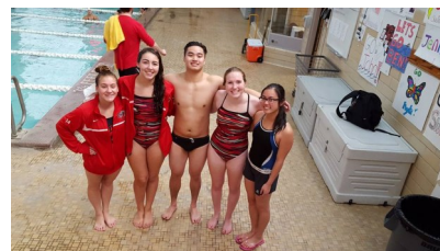
5 former members of the Tiger Shark Swim team compete in a college meet this fall

The Waltham Tiger Shark Swim Team: The Swim Team opened up their 2015-16 season with a victory against Watertown on Halloween. The team currently has 70 members with 15 of them being brand new swimmers. The group is a talented bunch and looks to be competitive in the swim league.